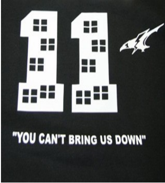
9/11 graphic on the shirts of the junior students.

A group of nine Detroit students are facing trouble for wearing self-designed t-shirts depicting a caricature of the 9/11 attacks on the World Trade Tower.